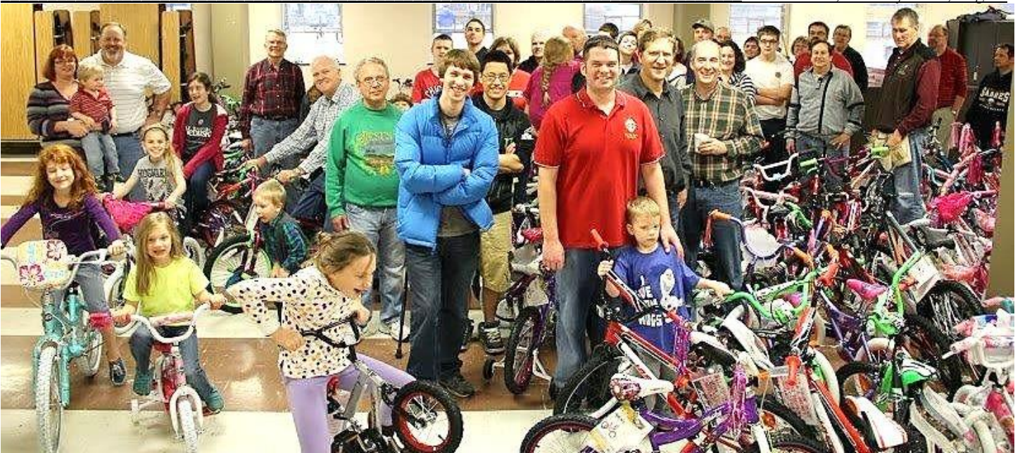
Knights of Columbus members and their families devote their annual Christmas party to the assembly of dozens of bicycles for boys and girls who wouldn't have them otherwise. Money for the bikes comes from the Knights' Lenten fish fry proceeds.