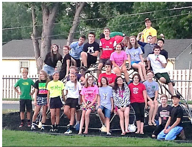
Senior rally on the playground, October 2014

We are planning a night at Sempecks in Elkhorn, the Winter Jam Christian Music Concert at the end of January. The weekly Senior High Nights and Discipleship Groups will start up again after the break. We aim to build more leadership from within. The youth space may get spruced up via painting or decorating endeavors, and we hope to offer more for junior high and young adults to encounter Christ in their experiences. Going into the new year, the youth ministry expects to lead teens closer to Christ through our experiences, actions and relationships.